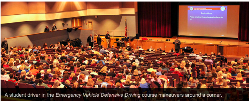
A student driver in the Emergency Vehicle Defensive Driving course maneuvers around a corner.